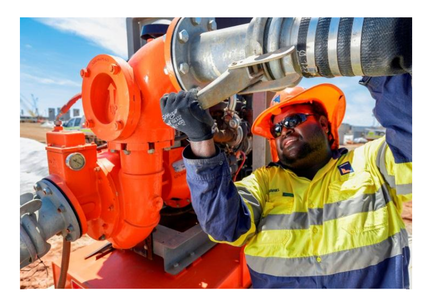
ATSI contractor working at the Ichthys LNG plant construction site