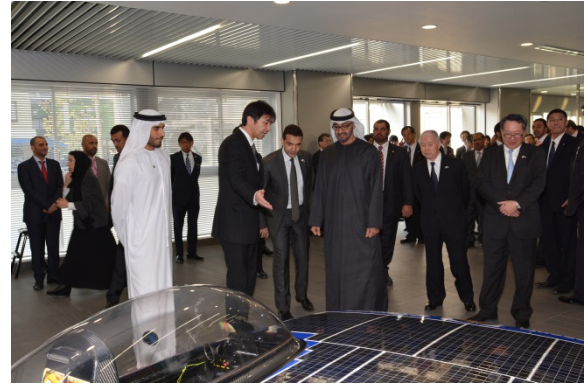
Crown Prince inspecting a solar car

Media Contact: INPEX Tokyo Office, Research & CSR Group, Tel) +81-3-5572-0230