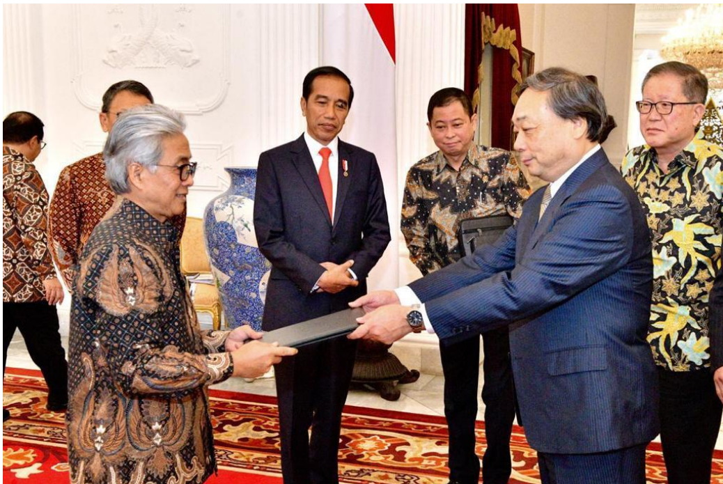
INPEX Receives Approval of Revised Plan of Development

https://www.inpex.co.jp/english/news/pdf/2019/e20190620.pdf