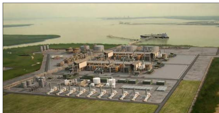
Ichthys LNG Plant, Darwin (image)