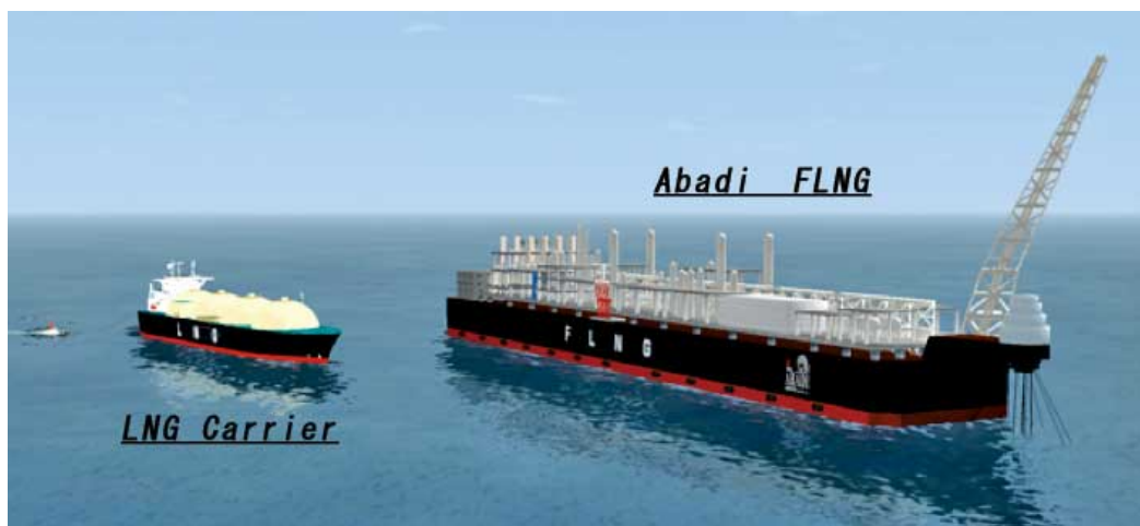
Abadi Project FLNG (image picture)

FEED: Planned to start by the 1 st half of 2012