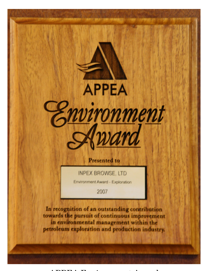
APPEA Environment Award