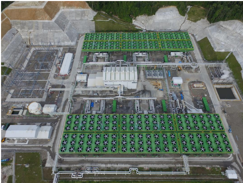
The first unit of Sarulla Geothermal IPP project

Tokyo, Japan - INPEX CORPORATION (INPEX) announced today that through its wholly owned subsidiary INPEX Geothermal Sarulla, Ltd., it commenced commercial operations of the first unit of the Sarulla Geothermal Independent Power Producer (IPP) Project (the Project), the world's largest single-contract geothermal power project located in North Sumatra Province, Indonesia, on March 18, 2017.