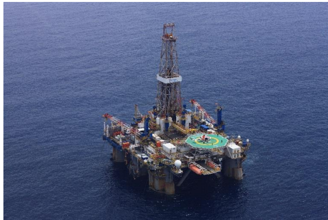
Semi-submersible drilling rig "M.G. Hulme Jr."

TOKYO, JAPAN - INPEX CORPORATION (INPEX) announced today that the drilling operations on an exploratory well offshore Shimane and Yamaguchi prefectures that began on June 5, 2016 were concluded on October 26, 2016.