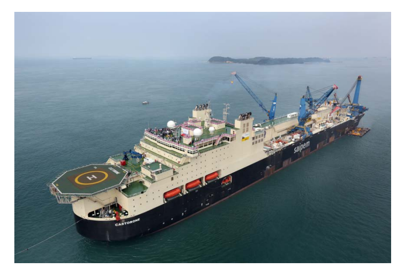
Deep water installation vessel Castorone

The SEMAC-1 is scheduled to be in Darwin Harbour for about four weeks. In total, the 164 kilometre shallow water pipelay installation is scheduled to take about 80 days. Once completed, the SEMAC-1 will transfer work to Saipem's deep water installation vessel, Castorone, which will lay the remaining 718 kilometres of pipe to the Ichthys gas-condensate field.