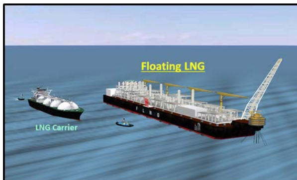
Floating LNG Facility (Image)

This acquisition takes place following EMPI's decision to divest its participating interest in the Abadi LNG Project. Based on the agreement, INPEX will continue to act as the operator and retain a 65% participating interest while Shell will hold a 35% participating interest.