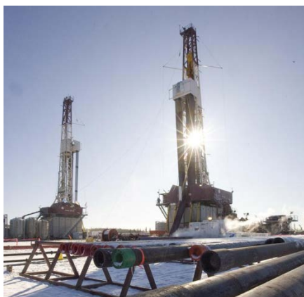
Left: Well pads in the Horn River Basin in February 2010 at 8 well pad drilling. It came onstream in October 2010

The Horn River, Cordova and Liard basins are located in northeast corner of British Columbia, about 1,000km north-northwest of Calgary, Alberta, Canada. These three basins are considered to contain high potential of large-scale shale gas reserves. The joint venture lands are comprised of Horn River 366km 2 , Cordova 333km 2 , and Liard 517km 2 , forming relatively large portions of each basin. In the Horn River basin, production has already started and it now produces shale gas of approximately 50 million standard cubic feet per day (8,000 barrels of oil equivalent per day). In the Horn River and Cordova basins, we envision a full-scale production of the shale gas is expected to be up to 1,250 million standard cubic feet per day (200,000 barrels of oil equivalent per day).