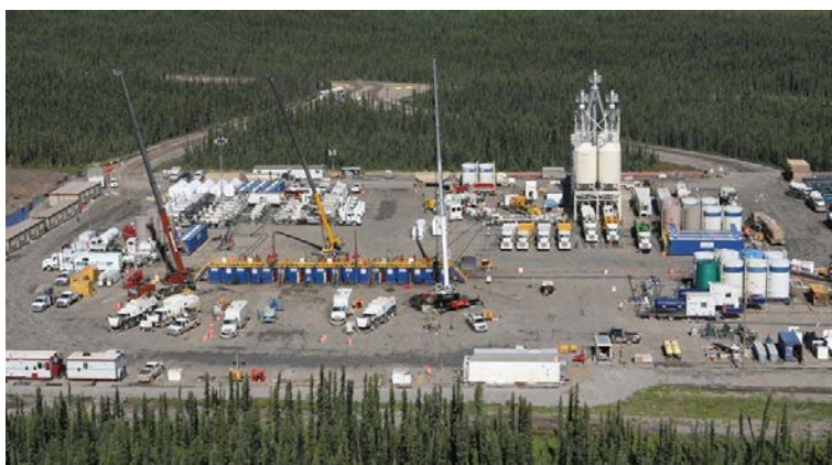
Right: Frac operations in the Horn River Basin in August 2011 at 9 well pad drilling. It came onstream in October 2011