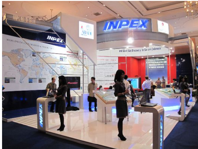
INPEX Business Booth

Public Relations Group, Corporate Communications Unit Akasaka Biz Tower, 5-3-1 Akasaka, Minato-ku, Tokyo 107-6332 JAPAN