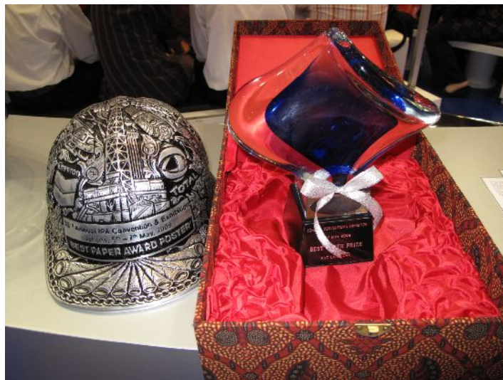
Best Paper Award Poster (Left)・Best Booth Award (Right)

INPEX has been expanding its exploration and development activities in Indonesia as one of its international business core areas. INPEX is conducting production activity in the Offshore Mahakam Contract Area with the largest gas production in Indonesia. INPEX as the operator holding a 100% participating interest, is also conducting preparation works for the LNG commercial development of the Abadi gas field.