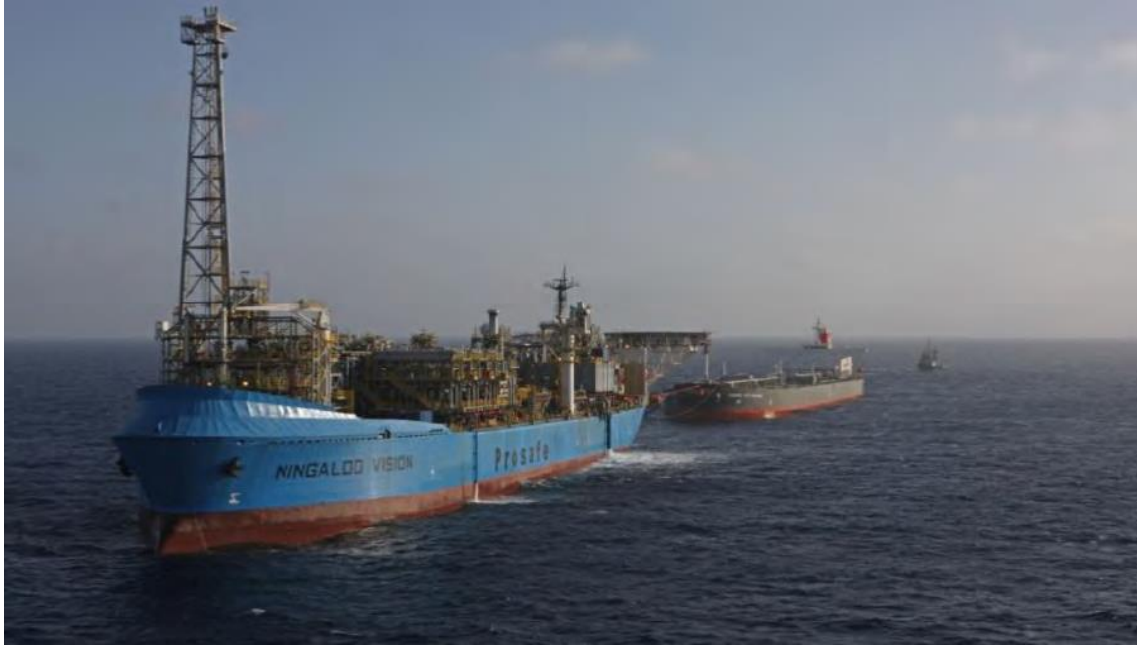
Floating production, storage and offloading (FPSO) vessel

INPEX is committed to further expanding its exploration and development activities in the Asia-Oceania region.