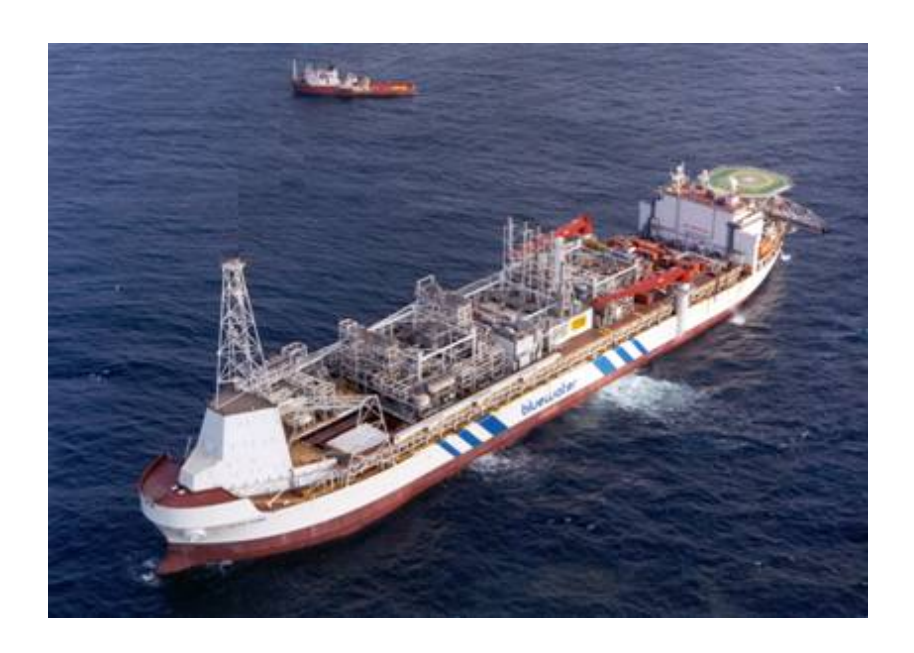
Floating Production, Storage and Offloading (FPSO) vessel

The Field is located approximately 240km south of Dili, the capital of the Timor-Leste, and 500 km northwest of Darwin, Australia. Discovered in 2008 at a water depth of 350m, the Field has been developed for production with the joint venture partners of Eni JPDA 06-105, Pty., Ltd. (40%) as an operator, Talisman Resources (JPDA 06-105), Pty., Ltd. (25%) and INPEX Timor Sea, Ltd. (35%). The crude oil produced from the Field is processed for offtake via the FPSO (Floating Production Storage and Offloading) and the level of production is projected at 40,000 barrels per day as a peak rate.