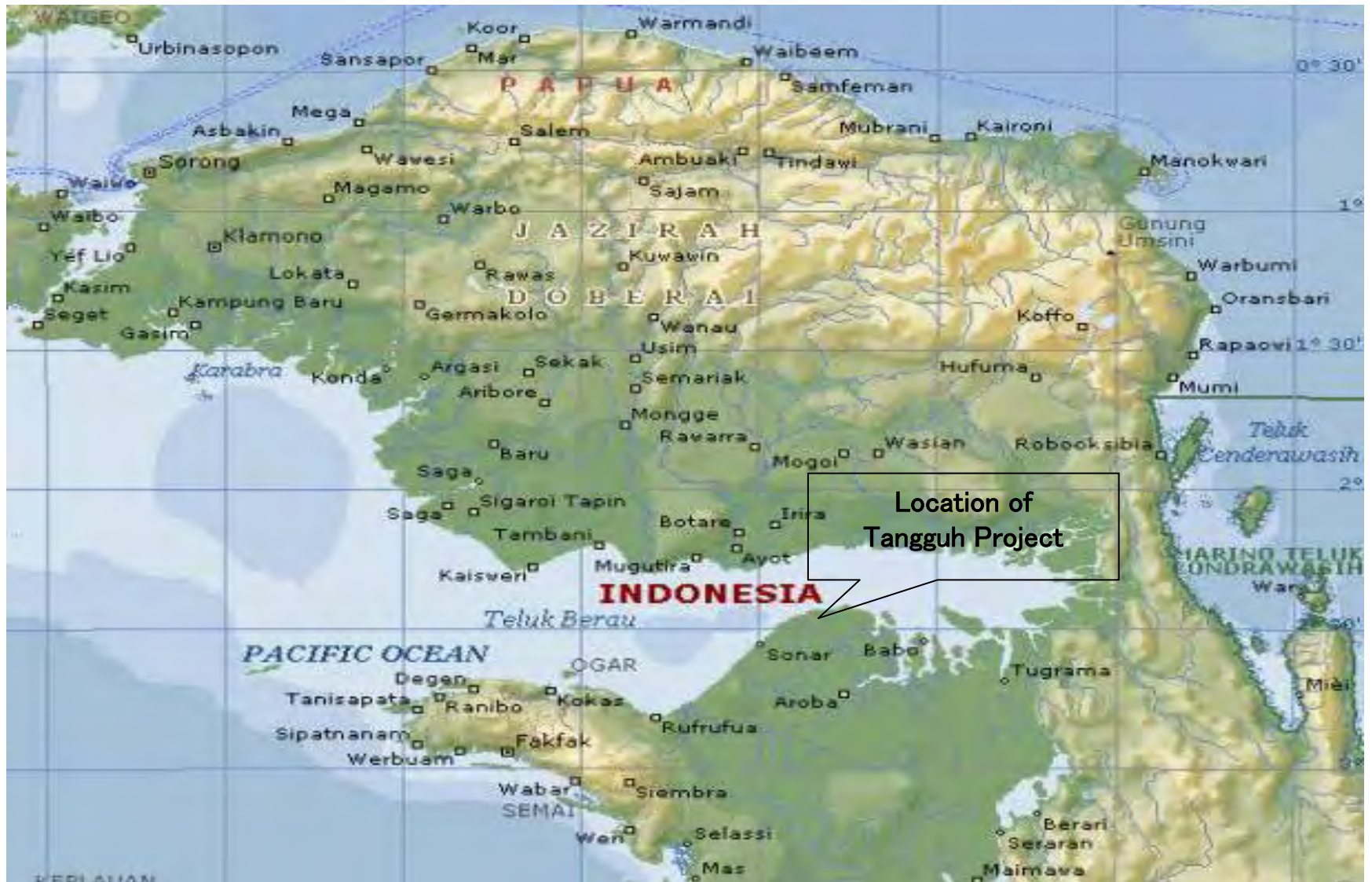
Location of Tangguh Project