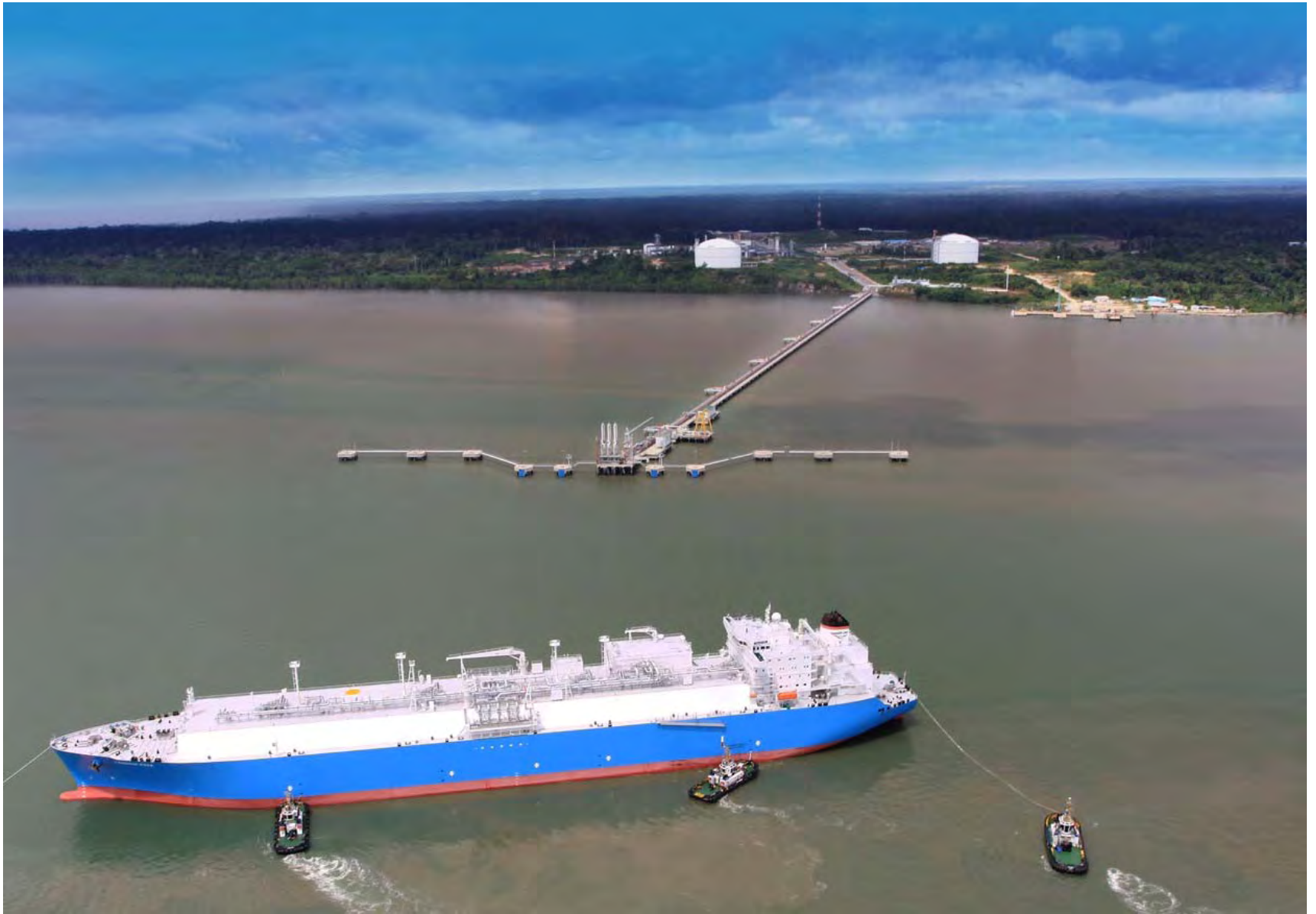
First Cargo “Tangguh Foja”