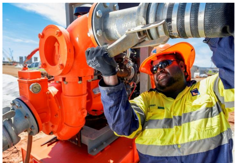
ATSI contractor working at the Ichthys LNG plant construction site