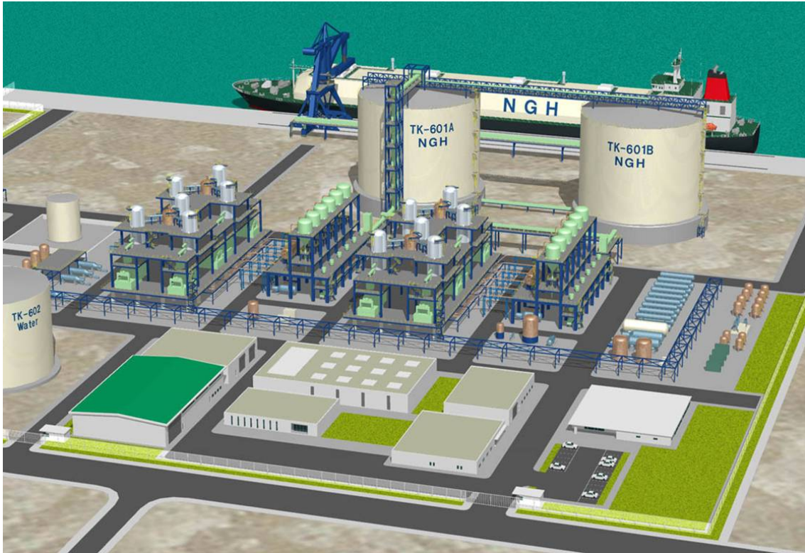
Image of NGH production and export facility