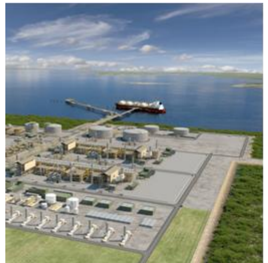
Ichthys LNG Plant, Darwin (image)