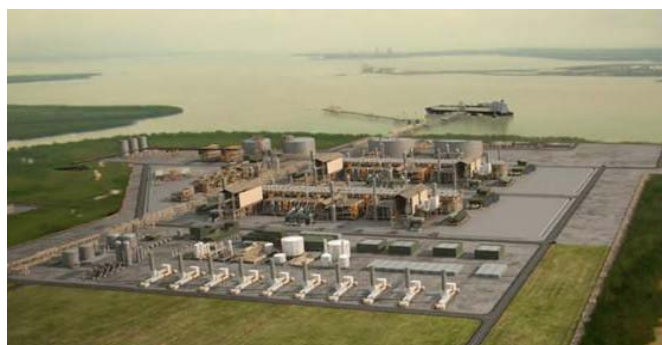
Ichthys LNG Plant, Darwin (image)