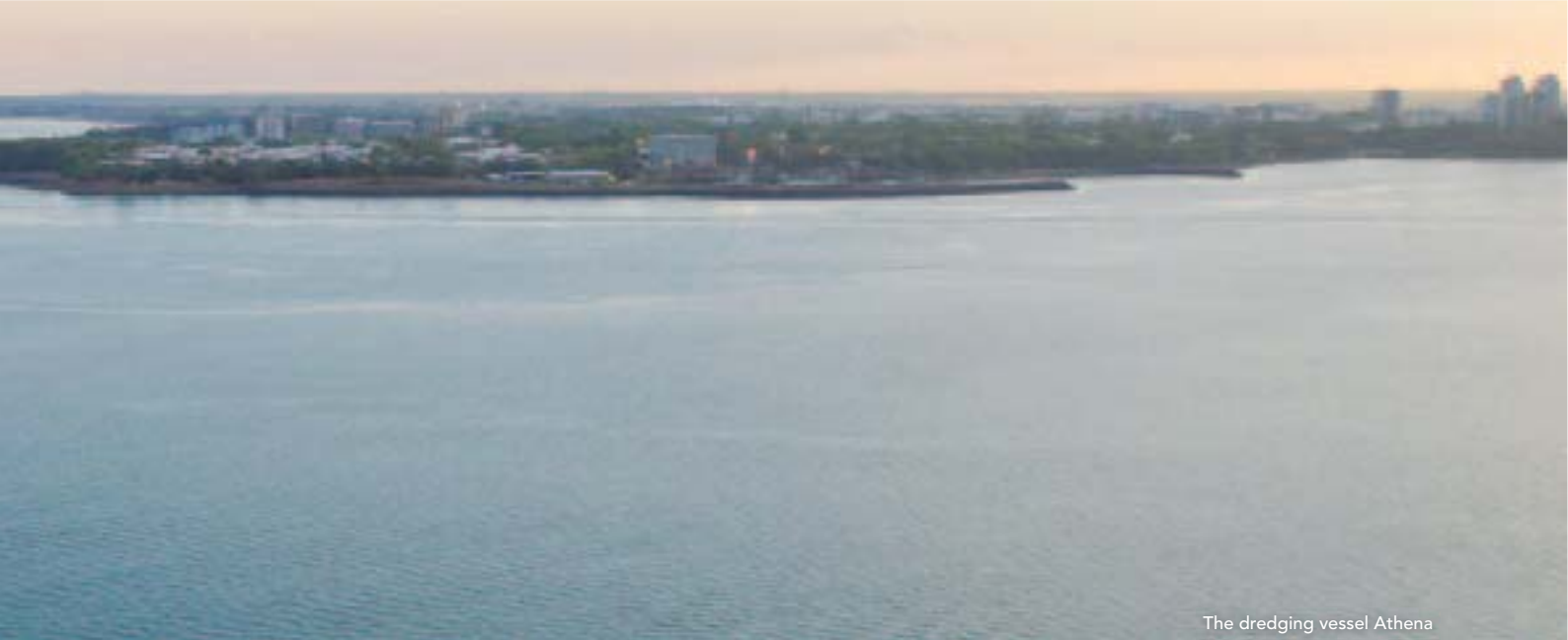
The dredging vessel Athena Dredging work at Darwin