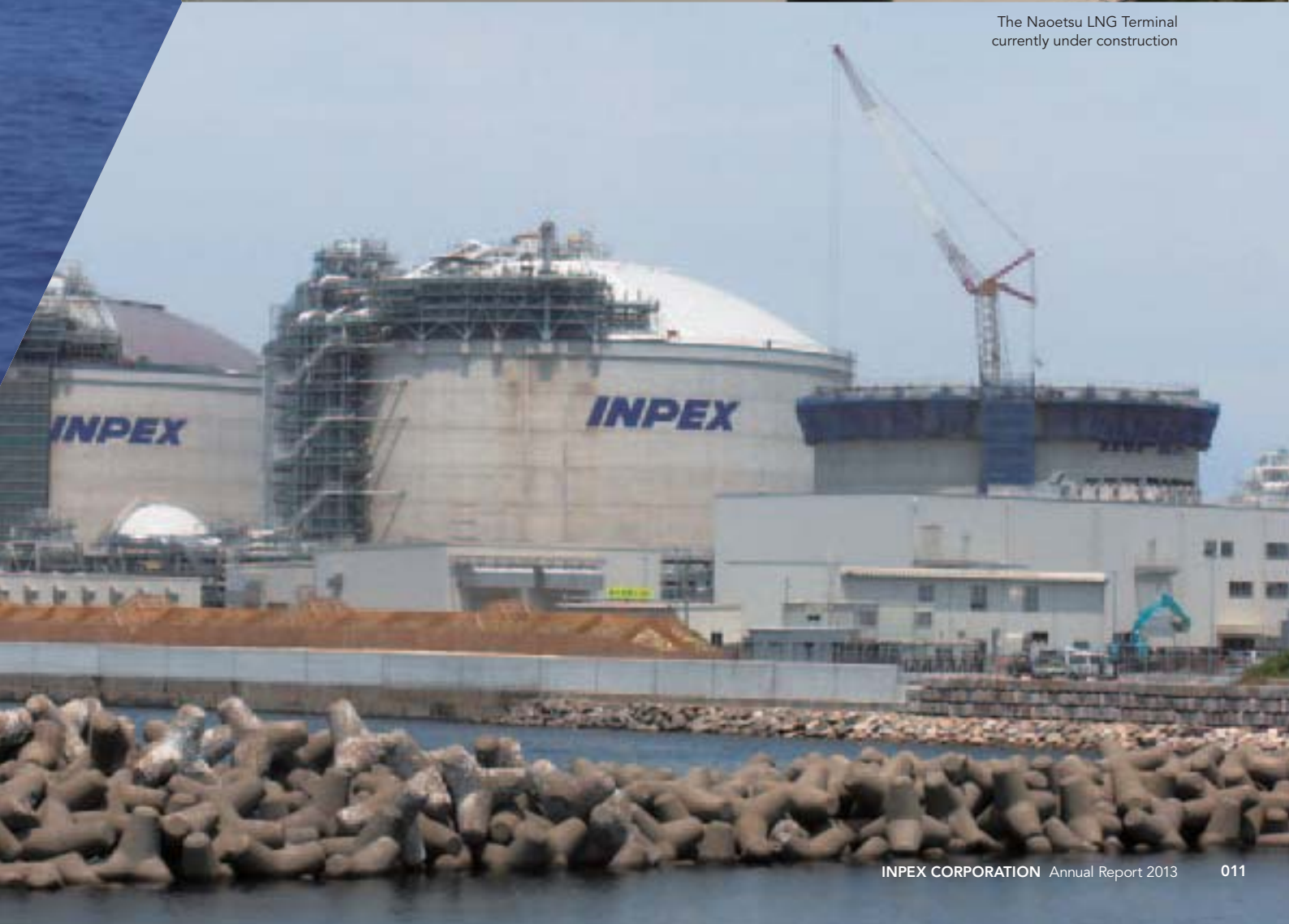
The Naoetsu LNG Terminal currently under construction