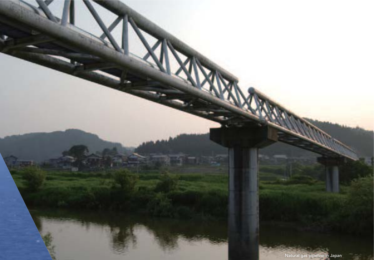
Natural gas pipeline in Japan