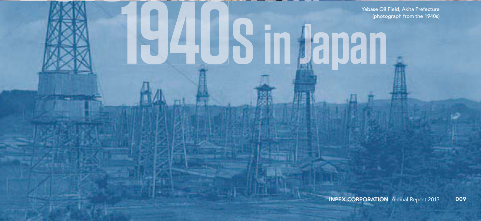
Yabase Oil Field, Akita Prefecture (photograph from the 1940s)