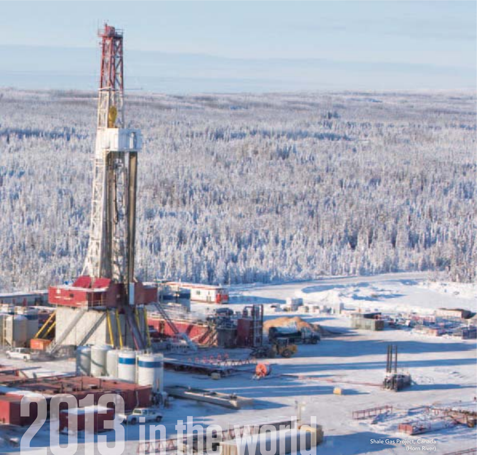
Shale Gas Project, Canada (Horn River)