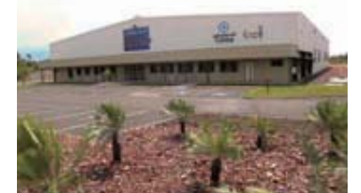
Larrakia Trade Training Centre