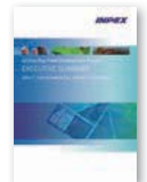
Environmental Assessment Report Please refer details on : http://www.inpex.com.au/

In the case of the Ichthys Project, our efforts include providing vocational training opportunities for young people, such as local indigenous peoples, through the donation of approximately AUD2 million for the construction of the Larrakia Trade Training Centre. The goal of the school, which opened in April 2011, is to enable students to earn qualifications that will help them develop their careers, and currently 300 students are enrolled to learn professional skills. In addition, INPEX donated to those affected by the Queensland floods.