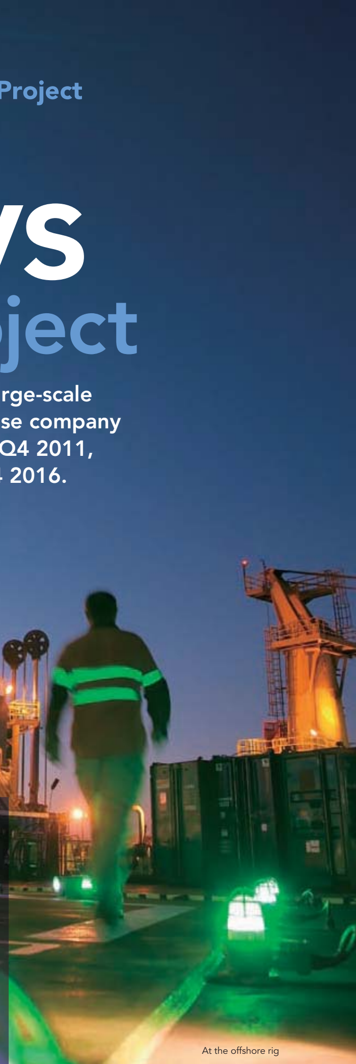
At the offshore rig